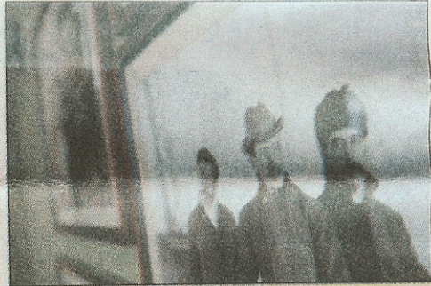
McCargo Hall (left) is one of the buildings at the 62-acre retreat, which was home to the American Marconi Wireless Telegraph Co. in the early 1900s. Above, a portrait depicts radio pioneer Guglielmo Marconi.